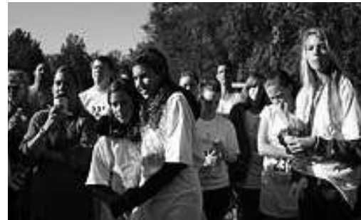
Old Field School's Running Team

Sparks-Glencoe's first annual Run For Green took off. The 5k race, 2 mile fun walk drew approximately 75 participants from all parts of Maryland and neighboring states to the NCR Trail. Support from the local community